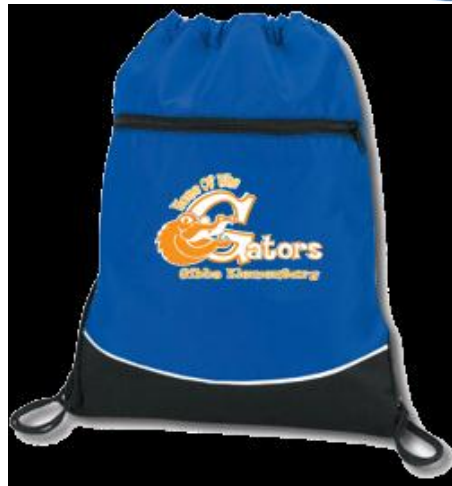
Sport Bag w/Zip Pocket

To view the spirit wear in color go to www.gibbespta.org/fundraising