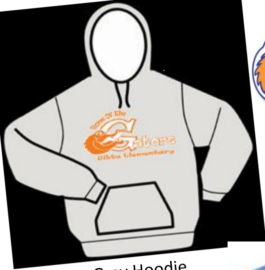
Heather Grey Hoodie