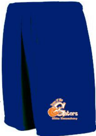
100% Polyester Drawstring Shorts