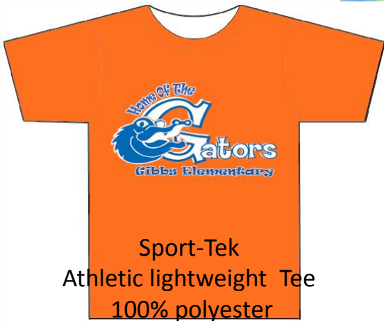
Sport-Tek Athletic lightweight Tee 100% polyester