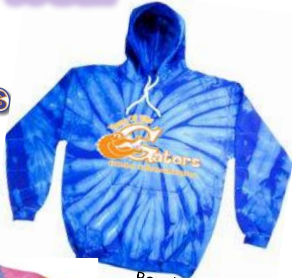
Royal Blue Tie Dye Hoodie